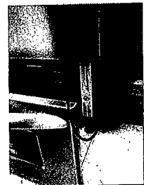
Serial plate is located by opening the range drawer at the bottom of the unit.

If you have one of the affected ranges, stop using it immediately and call Frigidaire toll free at 1- 800-449-9812 between 8:00 a.m. – midnight, ET Monday through Saturday, or visit www.smoothtoprangerecall.com , for more information on the recall and to make arrangements for a free repair.